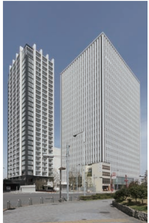
■ Nagoya Prime Central Tower ■ Aichi ■ Tokyo Tatemono Co., Ltd.