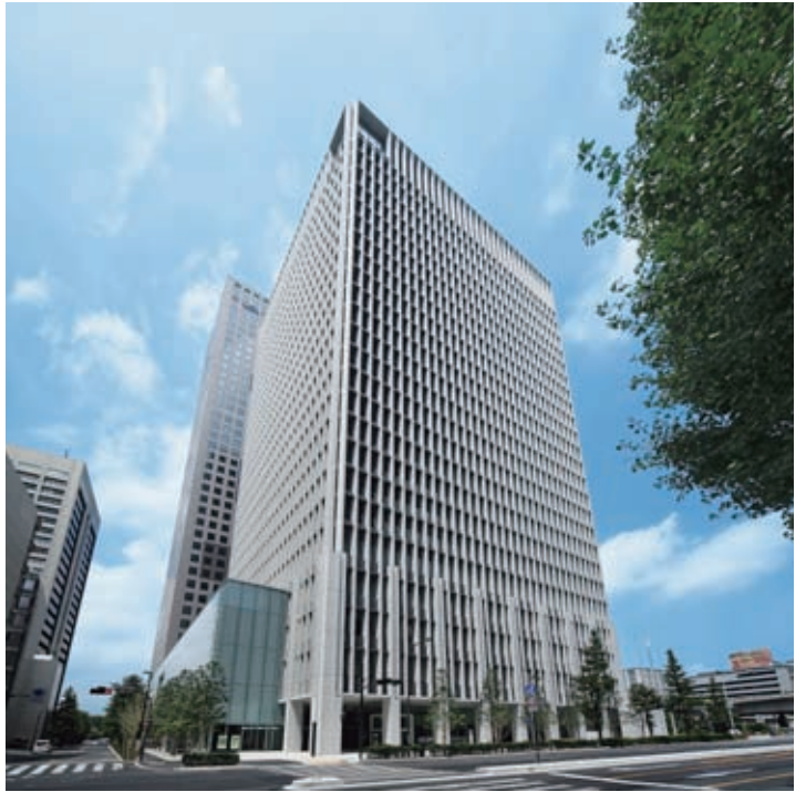
■ Keidanren Kaikan ■ Tokyo ■ OTEMACHI KAIHATSU, Ltd.