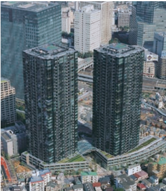
■ Osaki West City Towers ■ Tokyo ■ Urban Redevelopment Association of Osaki Station West Exit Central Zone