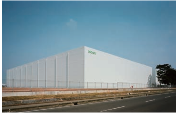
■ Hogy Indonesia Phase 4 Project ■ Indonesia ■ PT. Hogy Indonesia