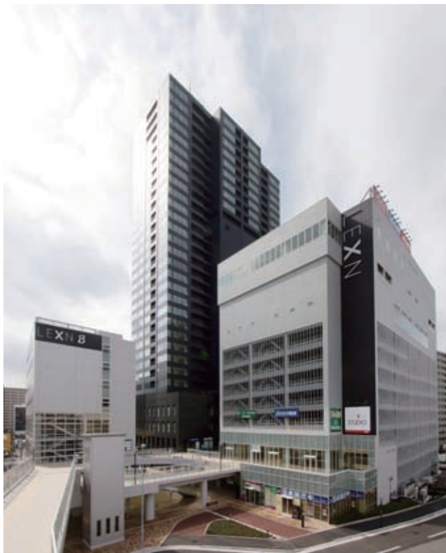
■ LEXN ■ Niigata ■ Urban Redevelopment Association of Niigata Station South Exit Zone 2