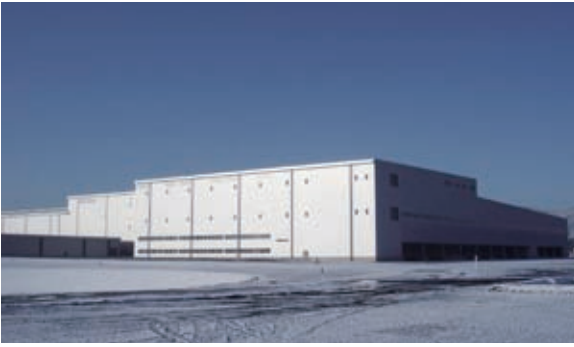
■ New Yorii Factory ■ Saitama ■ Honda Motor Co., Ltd.