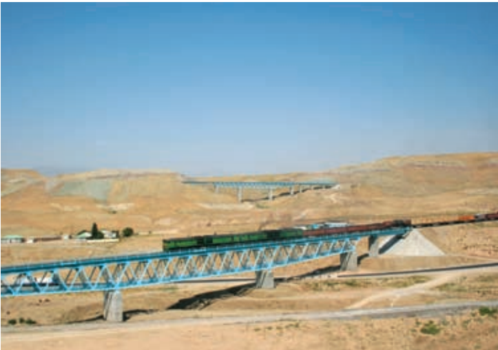
■ Tashguzar-Kumkurgan New Railway Construction Project ■ Uzbekistan ■ State Joint Stock Railway Company 'O'zbekiston Temir Yo'llari'