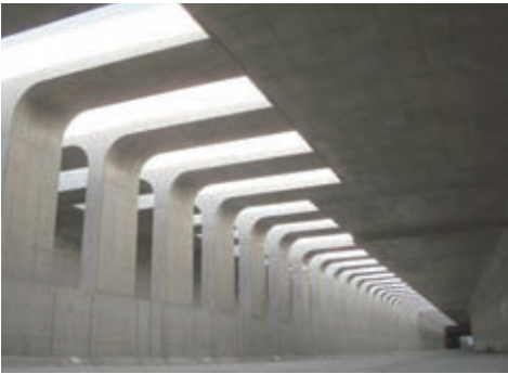
■ Higashi-Meihan Expressway, Momoyama Zone ■ Aichi ■ Central Nippon Expressway Co., Ltd.