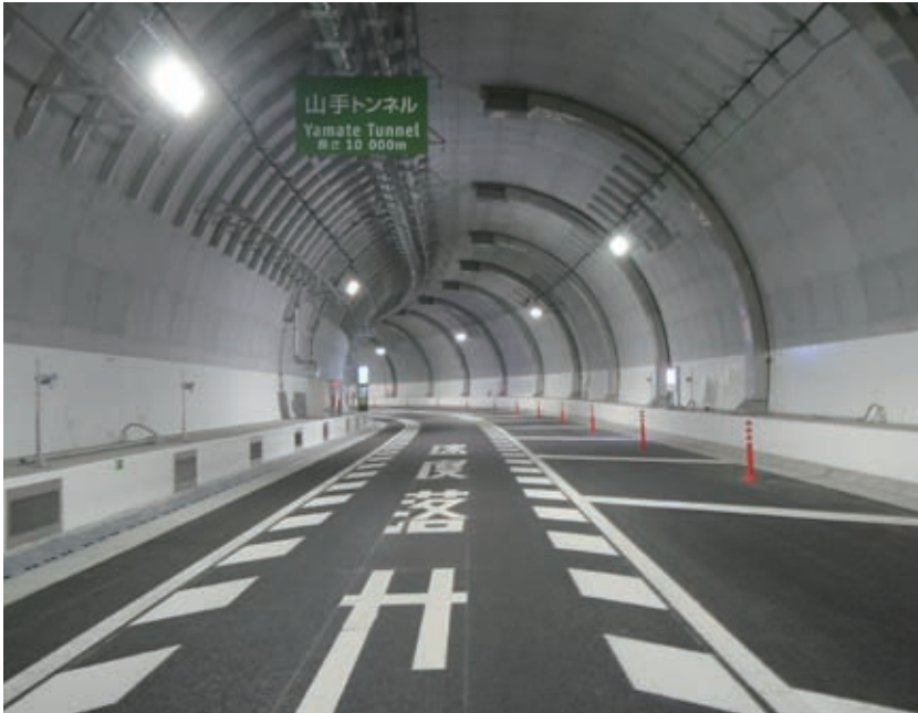
■ Central Circular Route, Yamate Tunnel ■ Tokyo ■ Metropolitan Expressway Co., Ltd.