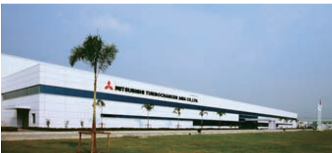
■ Asia New Factory Project ■ Thailand ■ MHI Turbocharger Asia Co., Ltd.