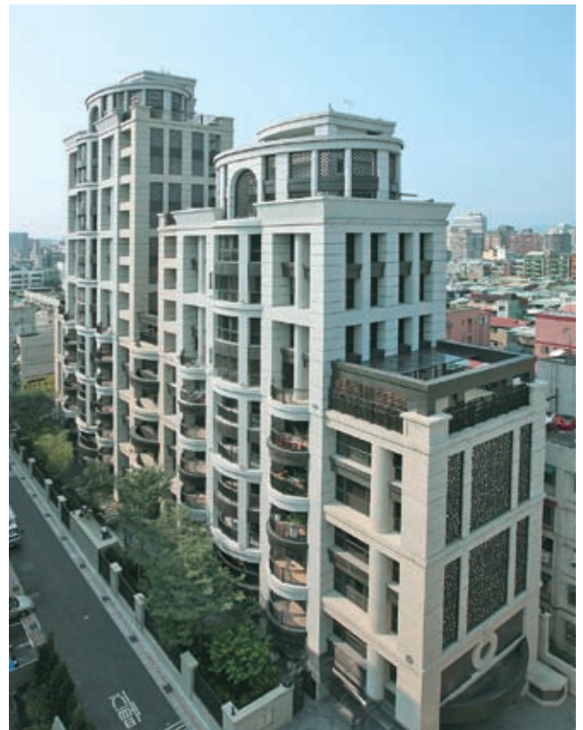
■ Yin-Hsiu Condominiums Project ■ Taiwan ■ Kuo-Mei Building Co., Ltd.