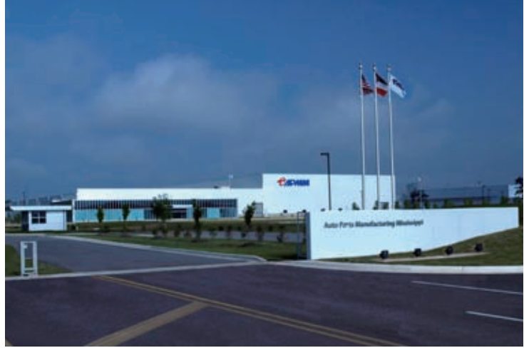
■ APMM New Factory Project ■ U.S.A. ■ Auto Parts Manufacturing Mississippi, Inc.