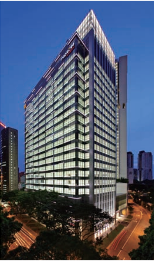
■ Mapletree Anson Road Office Building Project ■ Singapore ■ St. James Power Station Pte. Ltd.