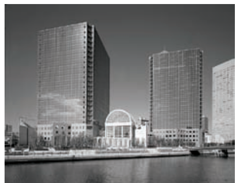
SEAVANS: SHIMIZU CORPORATION HEAD OFFICE