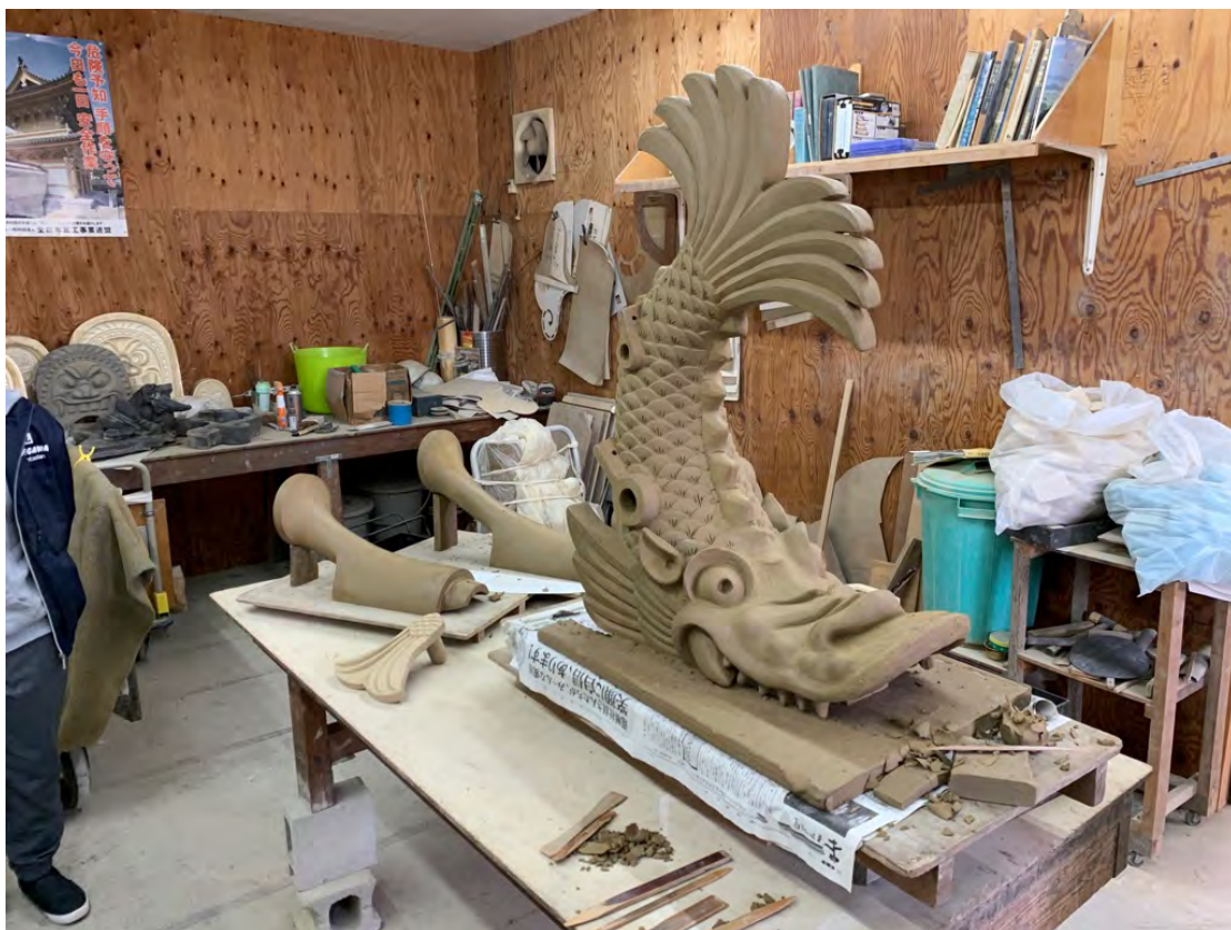
We inspected a prototype made based on the shachigawara clay mold confirmed with half body in September.