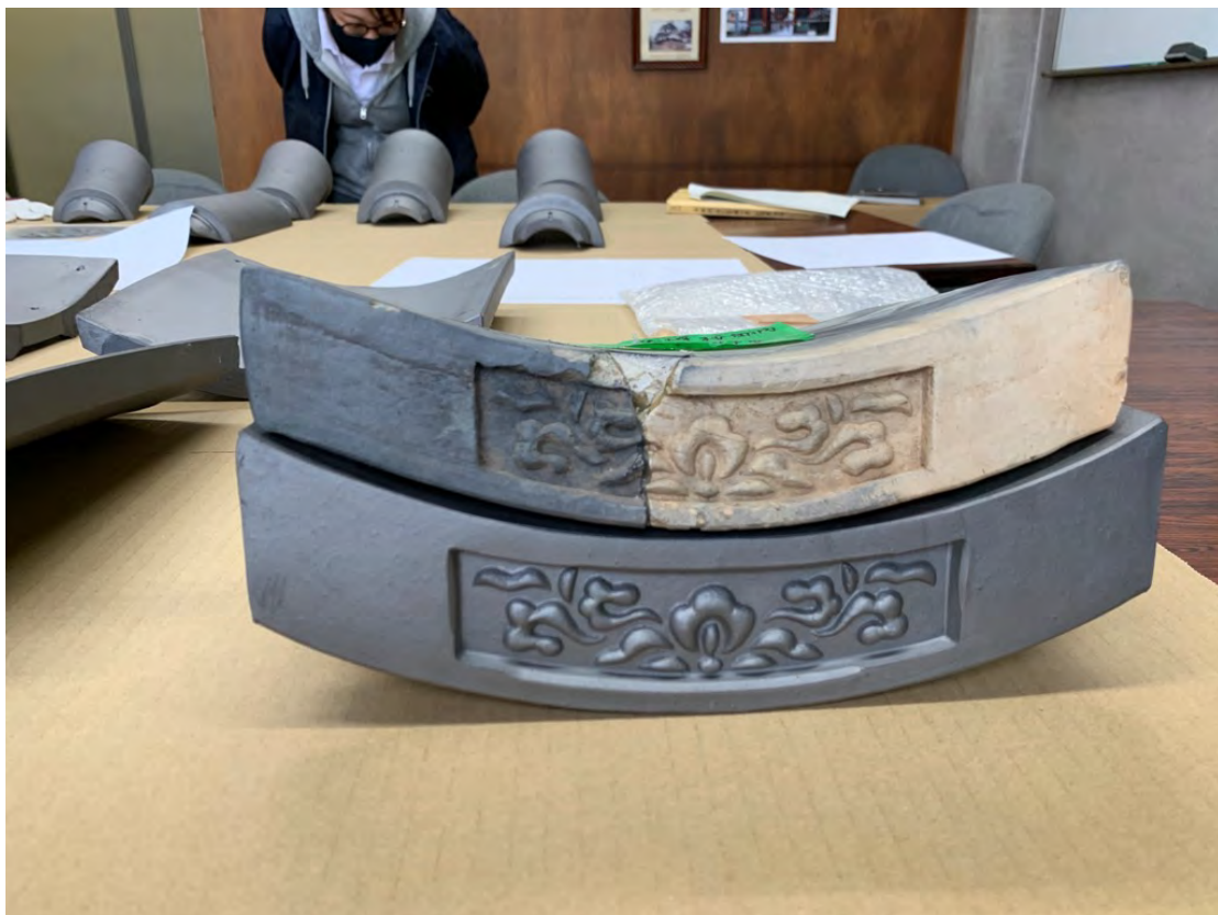
Similarly, we inspected prototypes of tiles baked based on the gatou confirmed in September.