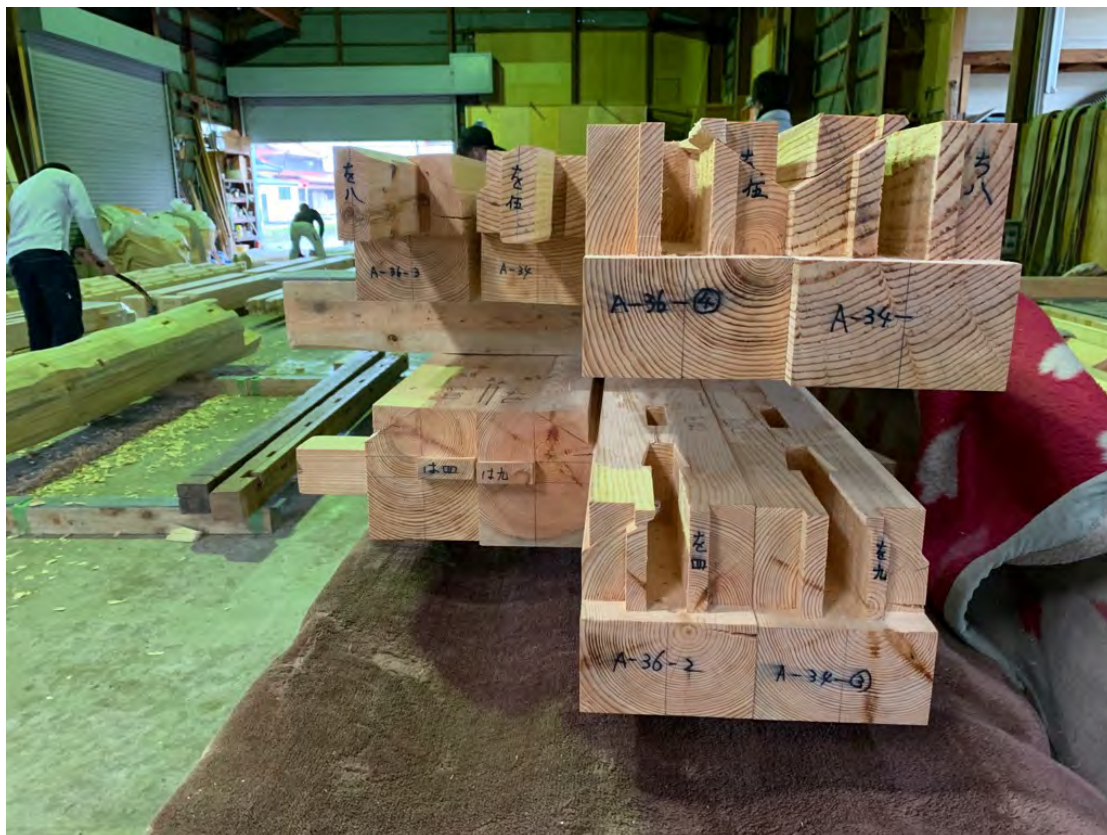
We checked the processing status of the joints.