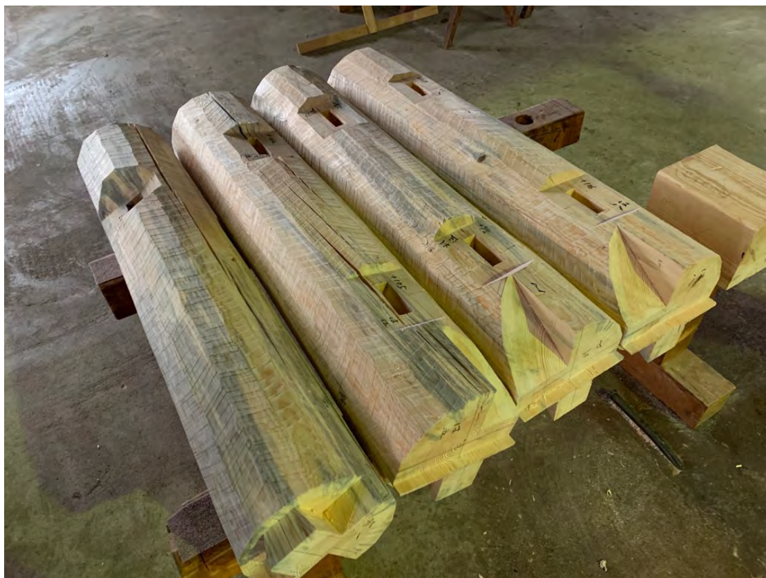
We checked how the timbers that started processing were finished with chouna (adze).