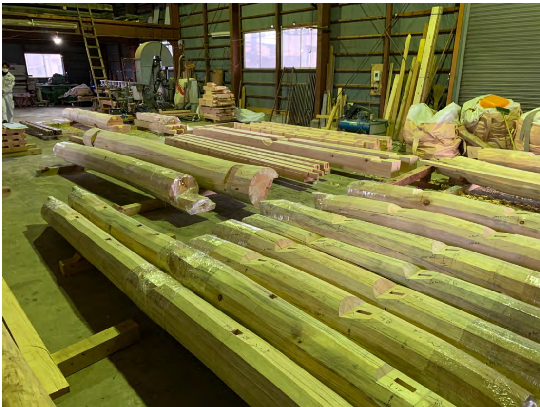
The timbers that started marking and processing. 【upper photo: timbers for roof truss, lower photo: timbers for rafter】