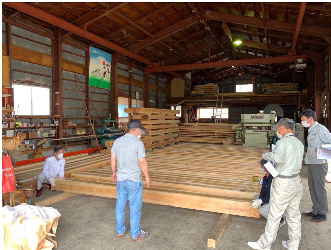
The timbers (pine and zelkova) used in Sakuragomon were inspected.