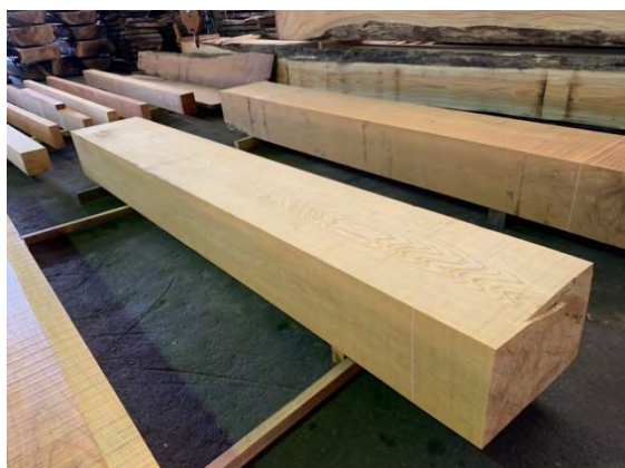
Main column (zelkova)