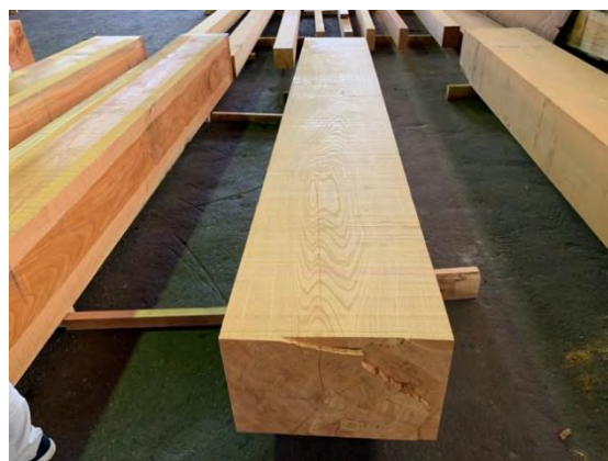
Main column (zelkova)