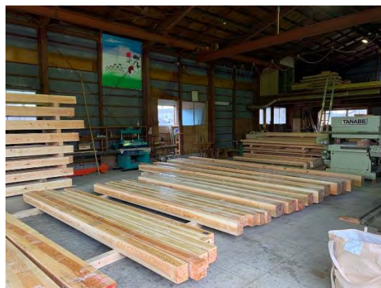
Square dressed timbers used as column and foundation, etc. (pine)