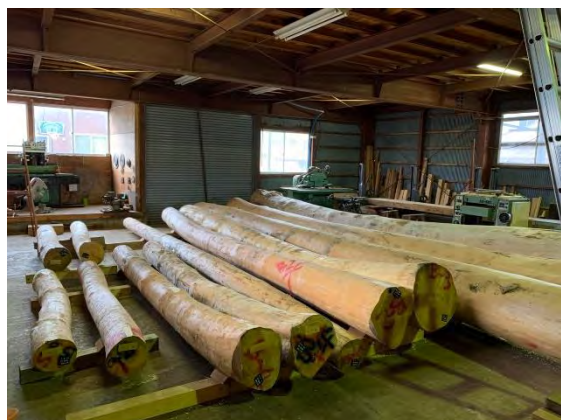
Round timber used as beam and others.(pine)