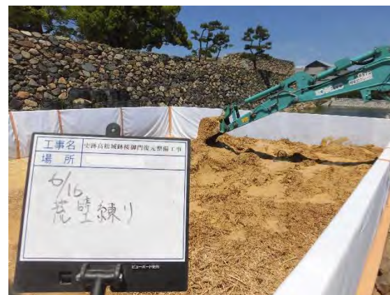
Wall clay is brought in, supplemented with additional crack prevention material and is being mixing.