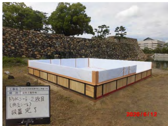
Production site of wall clay used as wall base coat was set up.